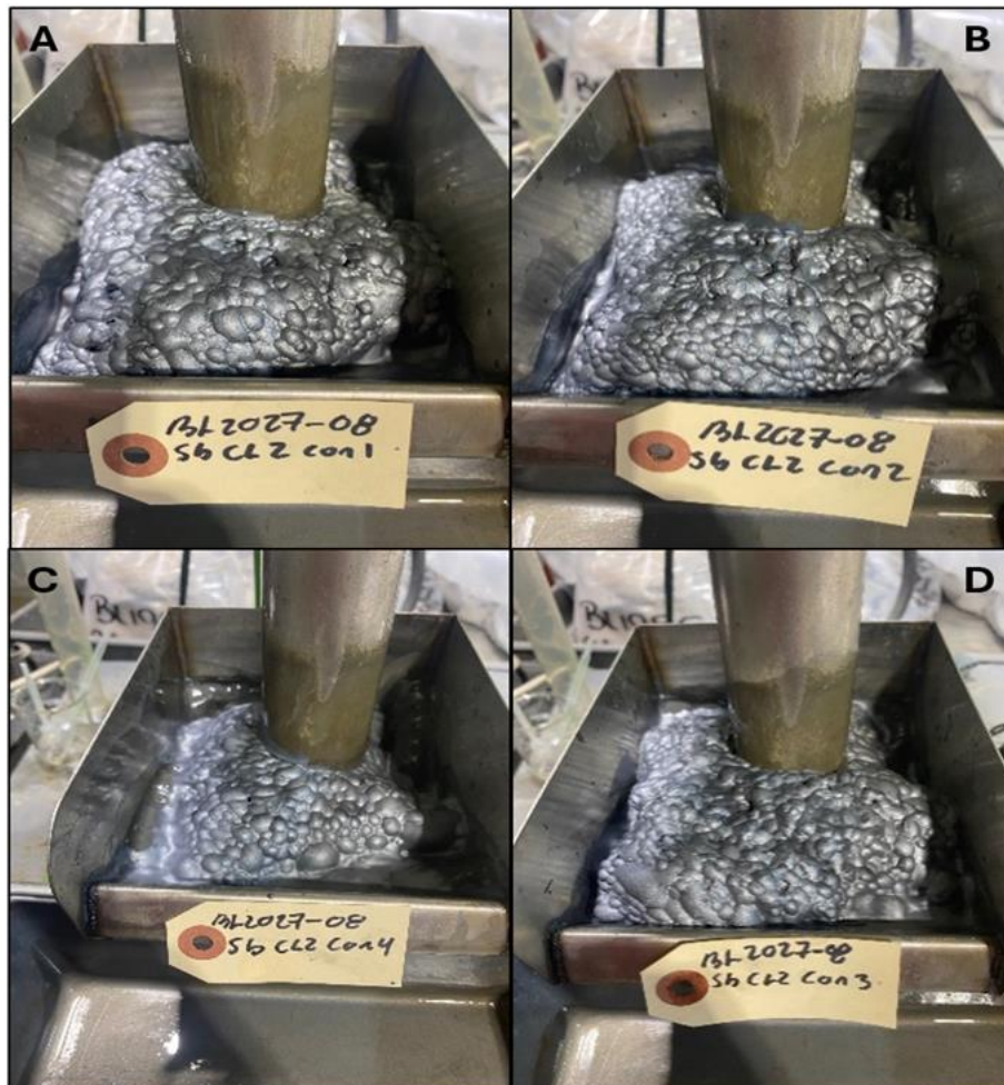
Figure 1; Photos of cleaner flotation test C08 for cleaning stage 1 (A), stage 2 (B), stage 3 (C) and stage 4 (D). Note silvery grey colour of the bubbles is due to stibnite collecting in

The updated metallurgical program has produced a concentrate grade far in excess of the minimum marketable grade of >55% Sb. Locksley's concentrate is approaching the theoretical maximum stibnite grade of 71.68% Sb.